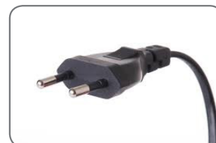
Europlug (C plug)