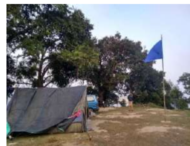
State Training Center Manikarneshwar, N.Ghy