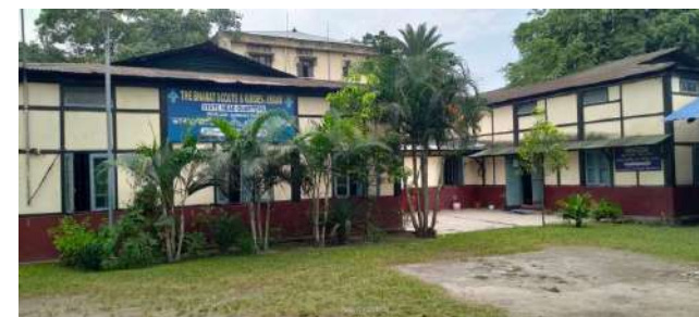
SHQ in Assam