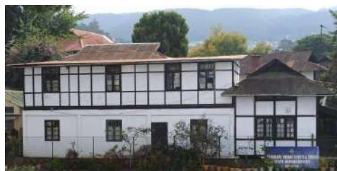
SHQ in Shillong

Scouting in Assam started in 1916 with its headquarter at Shillong. After the creation of the state of Meghalaya, the Bharat Scouts and Guides, Assam shifted to Guwahati with its Headquarter at Panbazar, Guwahati.