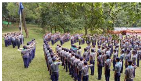
State Training Center Sonapur, Chamatapathar